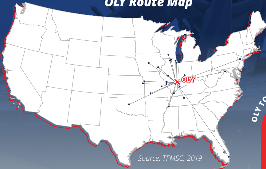
OLY Route Map

To understand the geographic reach of OLY, the map below illustrates the domestic origin and destination flights into and out of the Airport in 2019.